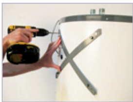
Included tank- or wall - mount bracket simplifies installation